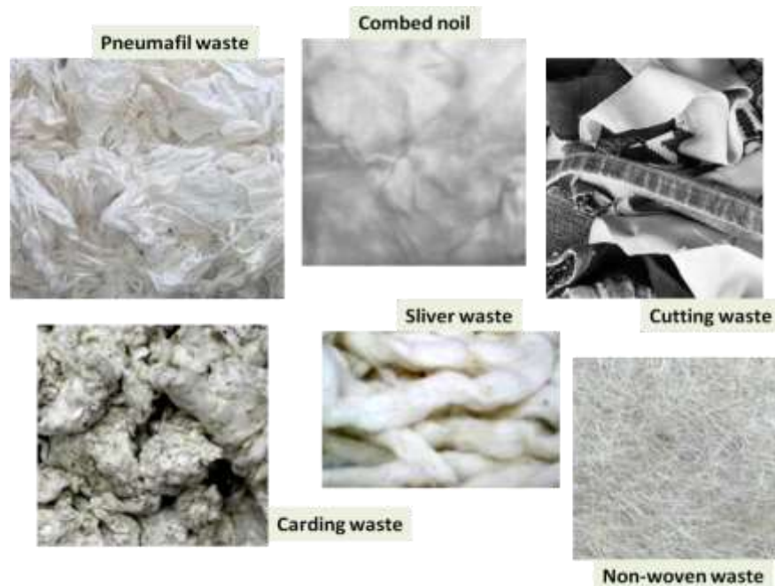
Figure 3. Examples of waste originated by textile world.

According to the study on textile waste lifecycle by Domina and Koch [42], all these different forms of solid waste, coming from fabric and apparel, can be grouped into two broad categories: one concerns the unsold merchandise and pre-consumer waste generated by retail that can be easily re-integrated through outlet, jobber, or non-profit organizations; another regards the post-consumer waste of fiber (yarn, fabric scraps, and apparel cuttings) generated by fiber producers, textile mills, fabric, and apparel manufacturers. For these latter, there are three possible disposal routes: (i) to be stored in the landfills, (ii) to be burned in incinerators in order to be converted into energy or powder, or (iii) to be sold to a textile waste recycler and re-converted into reusable goods.