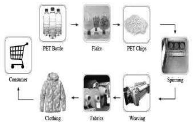
Figure 2. Flowchart showing recycling of PET bottles in to fibers, yarn into fabric

Following flow chart gives idea about thermal recycling of PET bottles